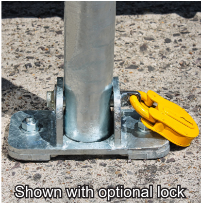
Shown with optional lock